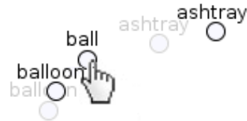
Figure 3: Hovering a visual term representation activates the trust-view showing more realistic distances (similarities) of other objects with respect to the hovered one (‘ball’). For better understanding, the transition of visual representation is animated, and original positions are depicted in light gray.

A more complex example of the trust view interaction is illustrated by Figure 4 (showing the initial situation) in contrast to Figure 5 (showing the triggered trust-view). In this example, the three verbs liegen ‘to lie’, sitzen ‘to sit’, and stehen ‘to stand’ from the gold standard class Position are marked in red, and the verb liegen is chosen for the trust-view. We can see that – while in the initial view the three verbs are located in some distances from each other, with verbs from other semantic classes between them – the trust-view brings them close to each other in 2d-view. The examples demonstrate that, with this mechanism, the trust-view offers both a good overview and the reliable analysis of semantic relations between a user-selected word vector and its neighbourhood.